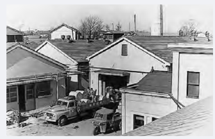
Time of establishment

In 1984, we changed our name to FSK CORPORATION. In 1986, we entered the semiconductor field by developing an ultraviolet (UV)-curable dicing tape that allows for adhesive strength to be controlled by irradiation of UV rays.