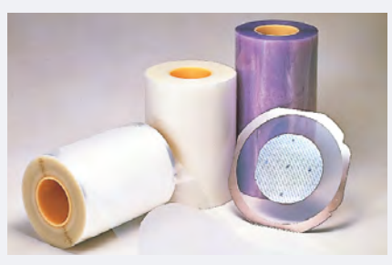
UV-curable dicing tape