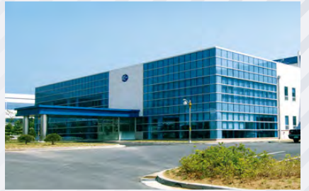
LINTEC KOREA, INC.