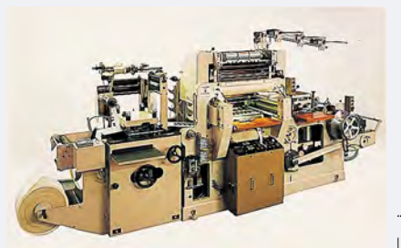
"A-100 type" label printing machine