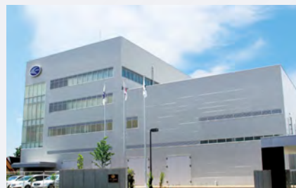
Advanced Technology Building