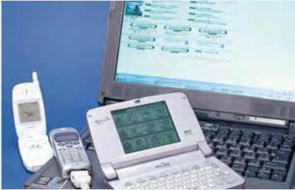
Optically functional films for LCDs