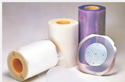
UV-curable dicing tape