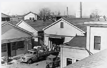
Time of establishment

In 1984, we changed our name to FSK CORPORATION. In 1986, we entered the semiconductor field by developing an ultraviolet (UV)-curable dicing tape that allows for adhesive strength to be controlled by irradiation of UV rays.