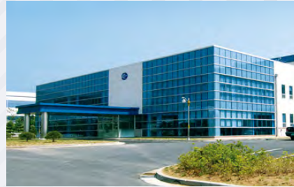
LINTEC KOREA, INC.